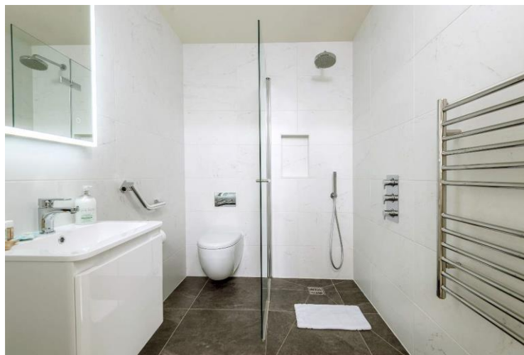
Downstairs en-suite wet room