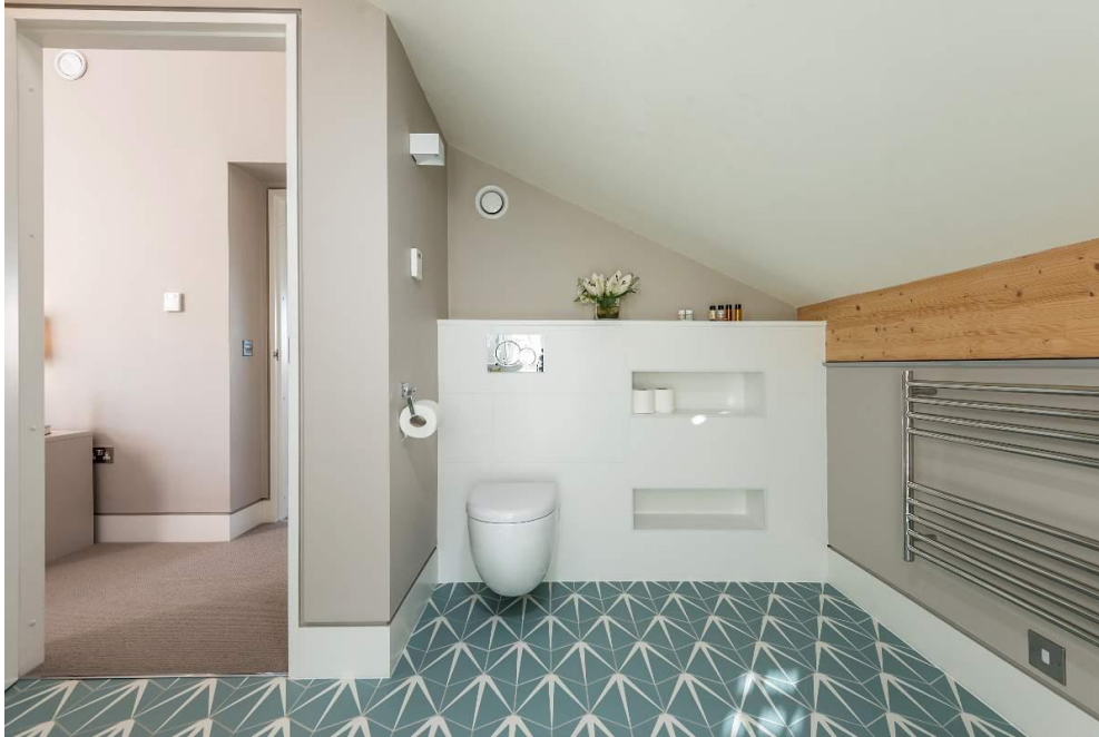
En-suite bathroom (bedroom1.)

This bathroom has a slope ceiling which is 2070mm high at the highest point and 1320mm at the lowest point, please be mindful of this