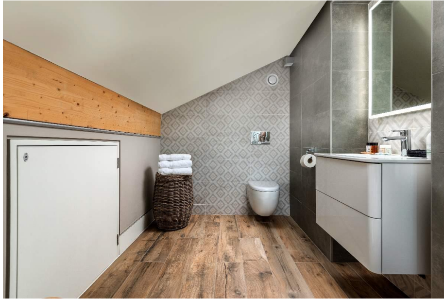
En-suite bathroom (Bedroom 2.)

This bathroom has a slope ceiling which is 2070mm high at the highest point and 1320mm at the lowest point, please be mindful of this