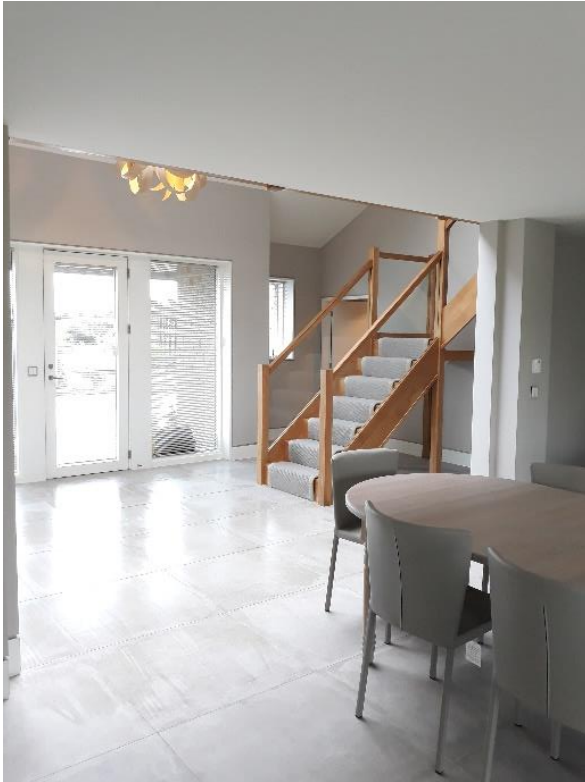
Hallway (Main entrance)