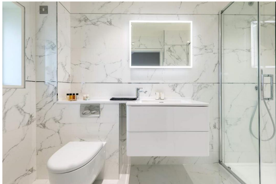
En-suite bathroom (Bedroom 2.)