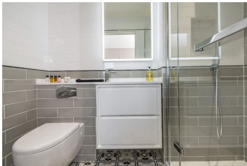
En-suite bathroom (Bedroom 4.)